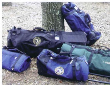
Club Glove products

Get a headstart on your holiday shopping online at www.fsga.org . There are some great gift ideas and stocking stuffers for that golfer in your family. Items include shipping and will be delivered to your door in a matter of days.