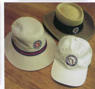
Hats from Ahead and Town Talk