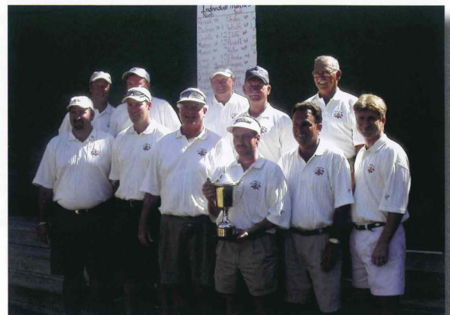
The North team celebrates their victory in the Florida Cup Matches .