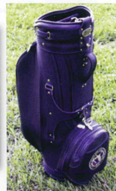
Burton golf bags