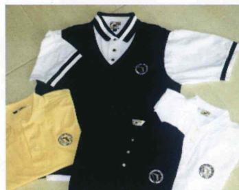
Cutter & Buck golf shirts and Ashworth sweater vests